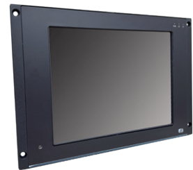
▲ Touch without keypad version