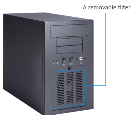
▲ Black chassis