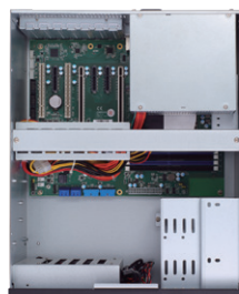
▲ Top view