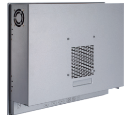
▲ Back view