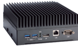
▲ Front view