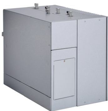
▲ Rear view